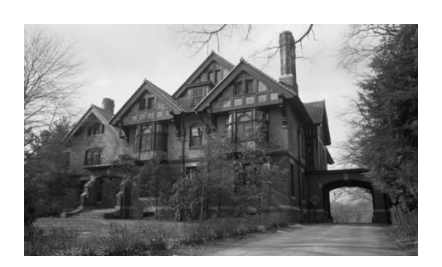
39 Woodland Street<sup>50</sup>

a fundraising campaign to purchase their new building at 39 Woodland Street, Hartford, Connecticut.<sup>48</sup> The major insurance companies of Hartford challenged each other and collectively raised half of the $50,000 needed to purchase and occupy the building; the other half was raised with the help of 462 individual donors.<sup>49</sup>